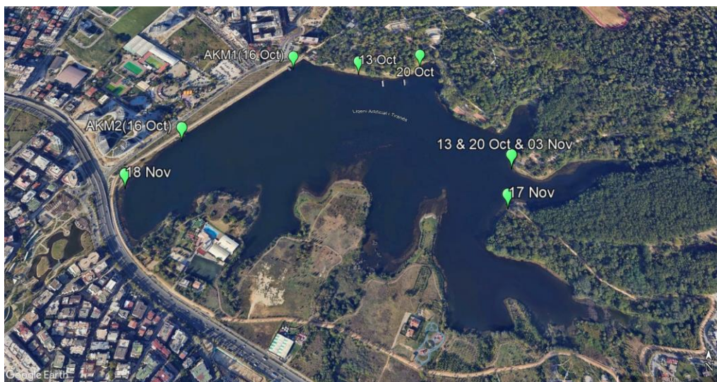
Figure 1. Lake Tirana satellite map with sampled sites (elaborated with Google Earth Pro 2021).

Tirana Lake is an artificial basin of 48 ha, with a 400 m dam (Fig. 1). It is the most important part of the Great Tirana Park, a public park of 290 ha, built in the 1950s, which lies in the southern part of the Tirana capital ( https://en.wikipedia.org/wiki/Grand_Park_of_Tirana ). The Park and its Lake, in the southernmost part, form a green-blue (terrestrial-water) ecosystem complex, very attractive and relaxing. The area is almost unique in its attractiveness for the whole Tirana urban area, with more than 800 thousand inhabitants, extending in more than 1,100 km 2 .