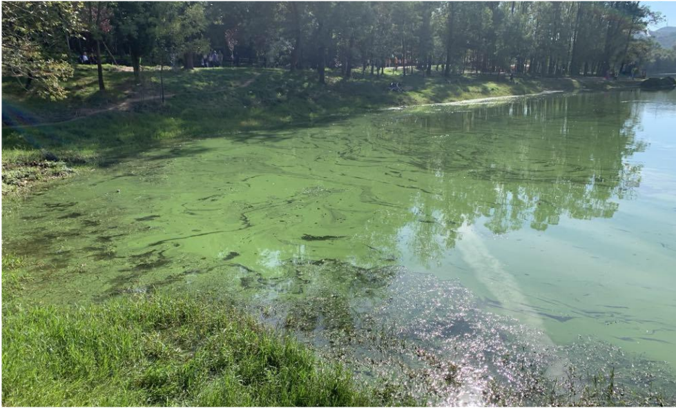
Figure 2. Photo from Lake Tirana, October 13, 2024

(Fig. 2). We will report here briefly some data related to this phenomenon, how to deal and prevent it in the future.